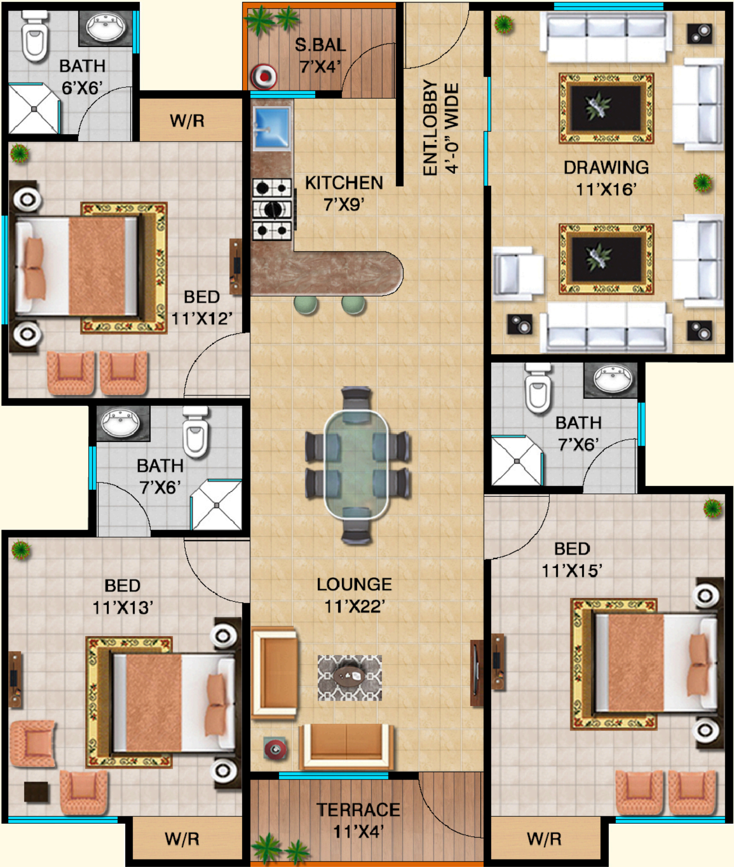
Type - A